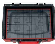
Homogeneous inner surface