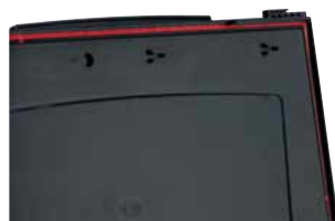
All-round red elastomer seal