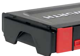
Lateral recessed handles