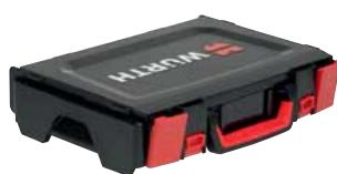
Closures with recessed handles