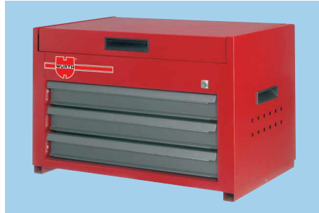
Workshop Case WK 2