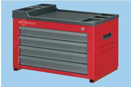
Workshop Case WK 1