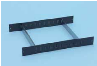
Partition and slotted plate