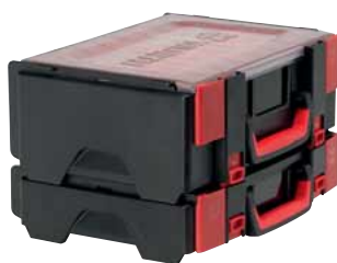
Connect several cases