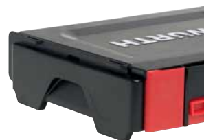
Lateral recessed handles