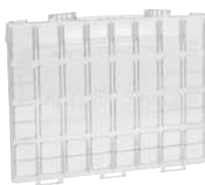
structure in transparent cover