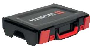
Closures with recessed handles