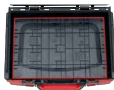
Homogeneous inner surface