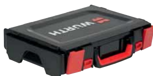
Closures with recessed handles