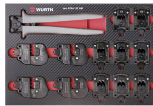
System insert for a secure storage of tool heads