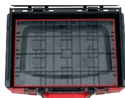
Homogeneous inner surface