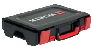
Closures with recessed handles