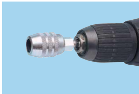
e.g. with adapter Art. No. 0614 176 700