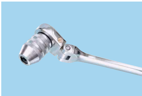
e.g. with ratchet wrench Art. No. 0714 253 13