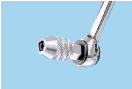
e.g. with 1/4" ratchet Art. No. 0714 11 151